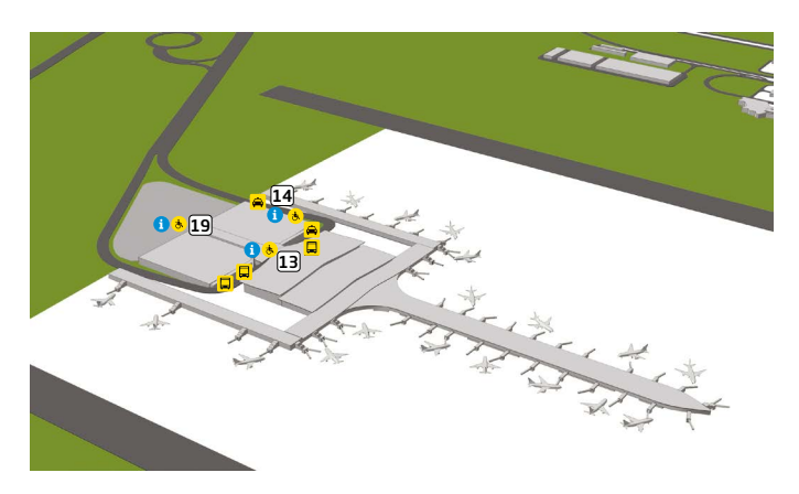
Access and car park

*PRM: A disabled person or person with reduced mobility