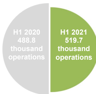
+6.3% Aircrafts H1 2021